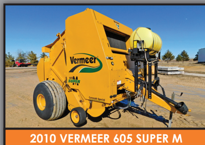
2010 VERMEER 605 SUPER M