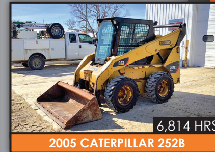
6,814 HRS. 2005 CATERPILLAR 252B