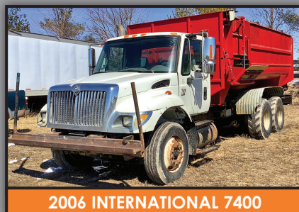
2006 INTERNATIONAL 7400