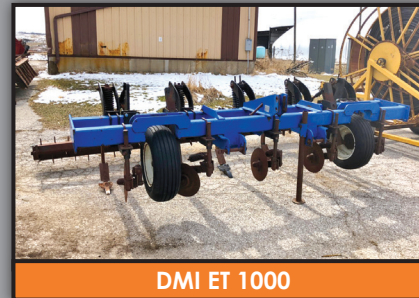
DMI ET 1000