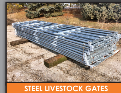
STEEL LIVESTOCK GATES