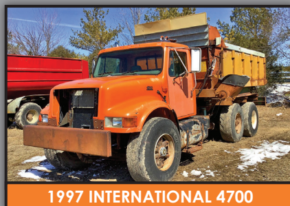
1997 INTERNATIONAL 4700