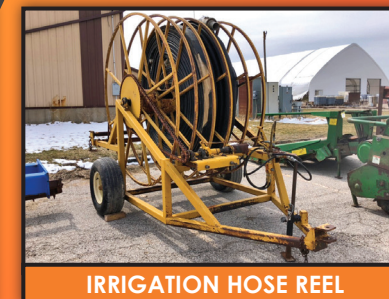
IRRIGATION HOSE REEL