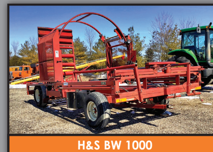
H&S BW 1000