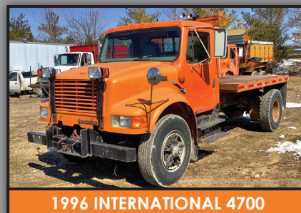
1996 INTERNATIONAL 4700