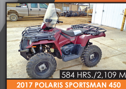
584 HRS./2,109 MI. 2017 POLARIS SPORTSMAN 450