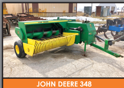
JOHN DEERE 348