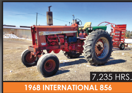
7,235 HRS. 1968 INTERNATIONAL 856