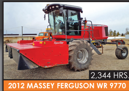
2,344 HRS. 2012 MASSEY FERGUSON WR 9770