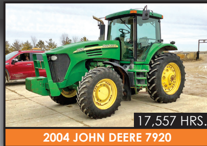
17,557 HRS. 2004 JOHN DEERE 7920