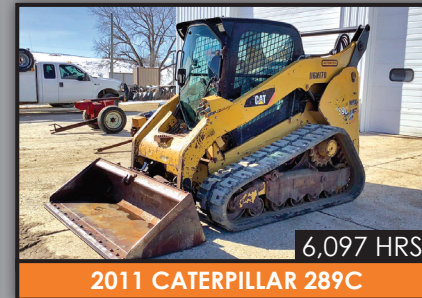
6,097 HRS. 2011 CATERPILLAR 289C