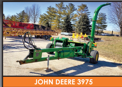
JOHN DEERE 3975