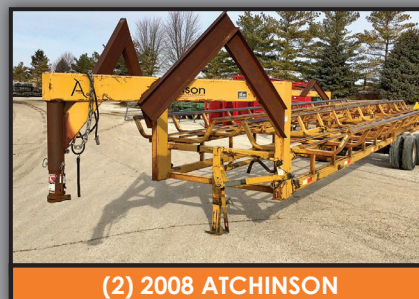
(2) 2008 ATCHINSON