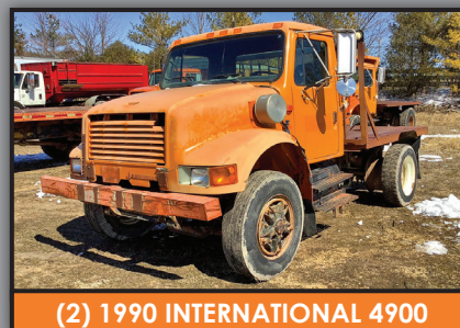
(2) 1990 INTERNATIONAL 4900